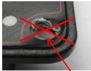
Over Tightening Causes Failures