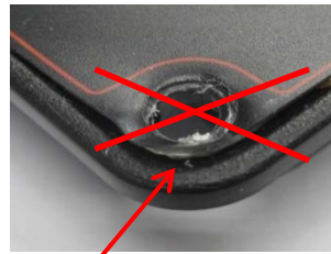
Lock Washer Damage